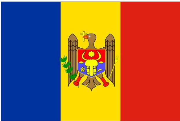
Republic of Moldova