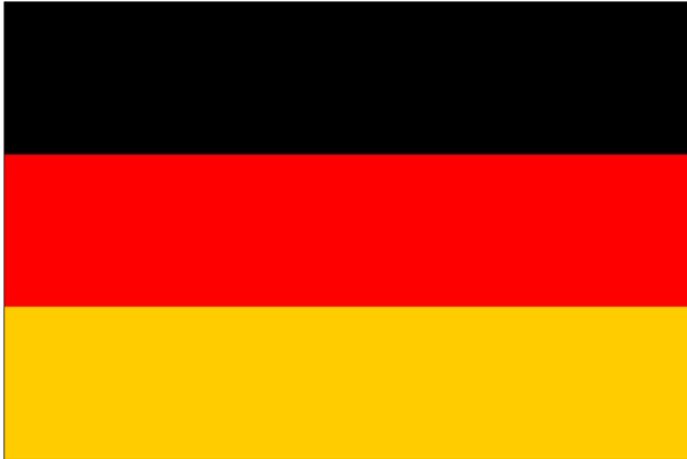
Federal Republic of Germany